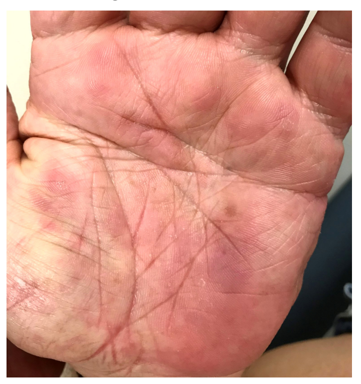
Figure 1 . Hand with erythematous plaques showing site of 4mm punch biopsy

A 72-year-old man presented with red plaques on the palmar surface of his hands. Other than feeling "swollen" the lesions were asymptomatic. He denied any itching, bleeding, pain, systemic symptoms, or recent illness ( Figure 1 ).