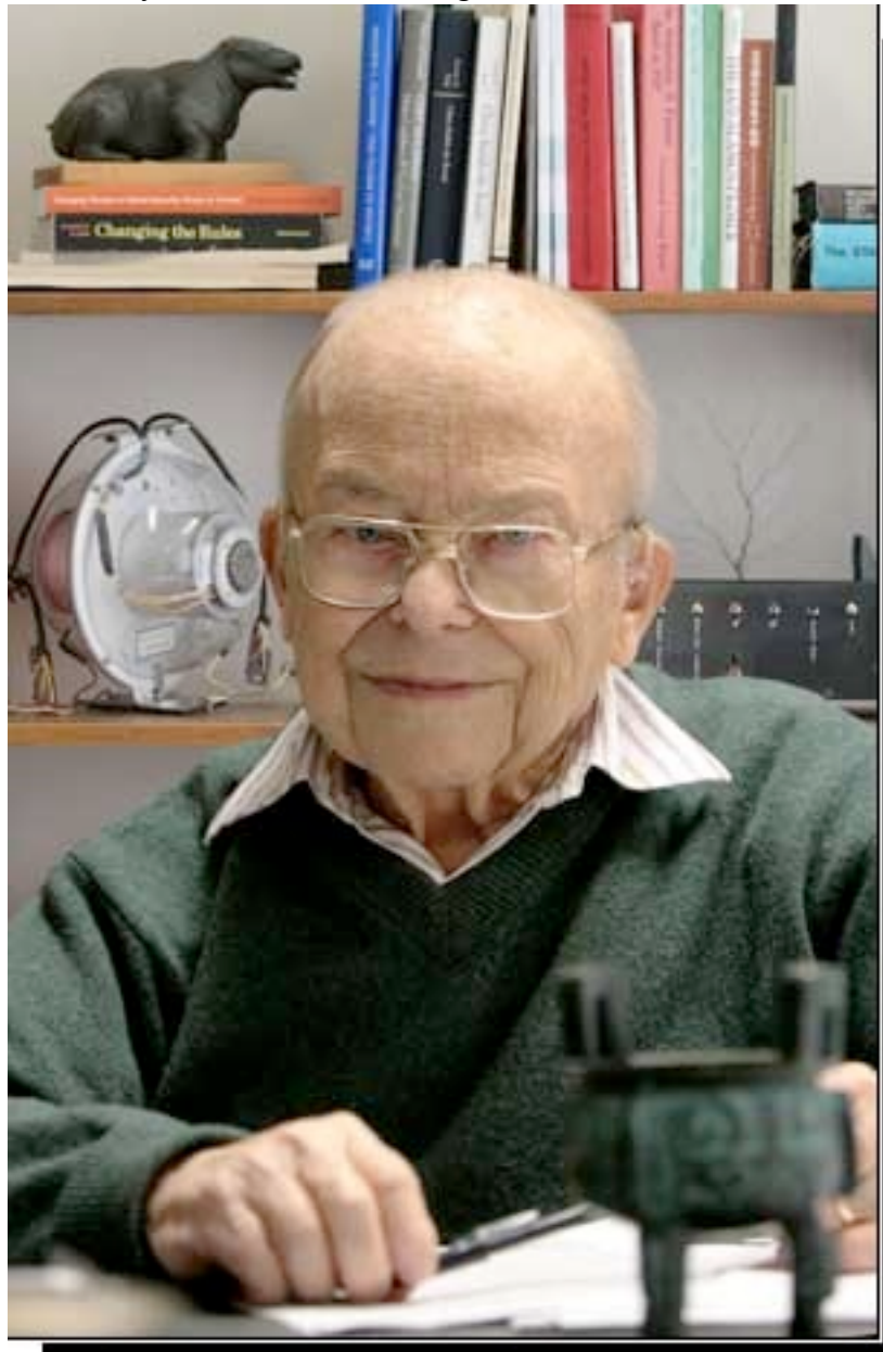
Figure 4. Wolfgang K. H. Panofsky, 2007

High Energy Physics Laboratory, he was the originator and first director of the Stanford Linear Accelerator Center from 1961 to 1984. Three Nobel prizes in Physics attest to, but do not delimit, the many important discoveries in particle physics made under Pief's aegis. On the national and world scene, his pragmatic and even-handed approach enabled him to work tirelessly and effectively for rational policies on nuclear armament and disarmament and international cooperation in science. These activities are described with typical candor in his memoir. 1 He was honored by governments, academies, professional societies, and universities, and became a revered wise old man of physics. Pief's move to "a small private University on the West Coast" was Berkeley's loss and Stanford's gain.