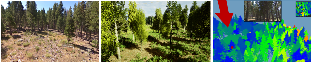
■ Figure 1 360° image (left), 3D model (middle, credit: J. Huang), and LiDAR point cloud (right).