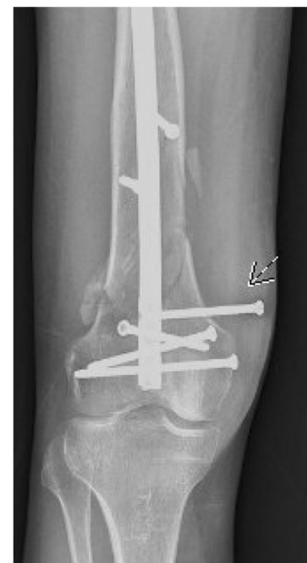
Fig. 2 Follow-up AP radiograph demonstrating 27.7 mm distal interlock screw back-out four weeks after treatment with RFNA. The alignment remained unchanged

Of the 27 patients in the RFNA cohort who experienced interlock screw back-out, 11 (40.7%) had periprosthetic fractures and 16 (59.3%) had native distal femur fractures ( p=0.2 ). 15 (55.6%) were recommended to be weight bearing as tolerated (WBAT) immediately, and 12 (44.4%) were recommended to be non-weight bearing (NWB), which was not a statistically significant difference ( p=0.4 ). 21 (77.8%) were geriatric (age over 65 years) versus 6 patients (22.2%)