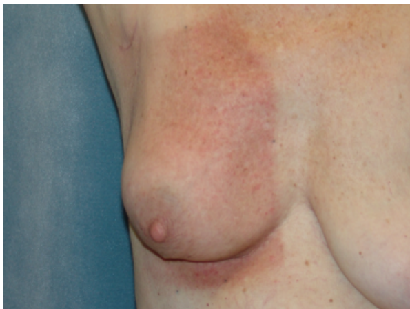
Figure 4. Grade 2 skin reaction.

differed in the patient populations of these studies. The differences between our study and the study by DeLand and colleagues are listed in Table 2. We used the three-dimensional conformal modality of RT, while DeLand and colleagues used the intensity-modulated RT modality, which is known to produce less skin toxicity. Three-dimensional conformal remains the most commonly used modality, but interest is growing in the use of intensity-modulated RT for breast cancer in the radiation oncology community because of reports of lower skin dose toxicity and less tissue reaction than with three-dimensional conformal. 15–18