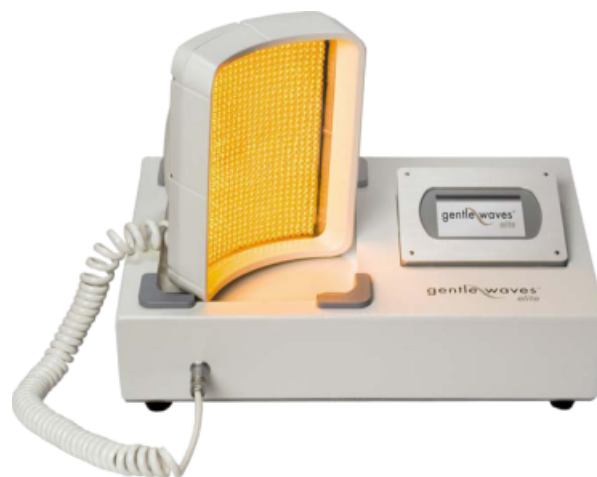
Figure 1. Light-emitting diode photomodulation device (Light BioScience, LLC, Virginia Beach, VA).

Patients in the treatment group received LED treatments immediately before and after each radiation session. Each LED treatment was administered using the GentleWaves Select 590-nm high-energy LED array (Figure 1) with the panel being placed within 2 cm of the patient’s skin. Each treatment lasted 35 seconds, using the same specific sequence of pulses used by DeLand and colleagues and in other studies, in which the pulses are 250 ms on and 100 ms off for 100 pulses. 9,10 Upon completion of the RT course, seven additional daily treatments were given over the next 2 weeks with the goal of preventing the delayed reaction seen in RT. Patients in the control group had sham treatments, in which the machine was placed on the skin at the same times in the same manner for