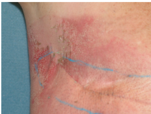
Figure 5. Grade 3 skin reaction.

In our study, severe reactions of grade 3 or higher were seen in only one patient in the control group