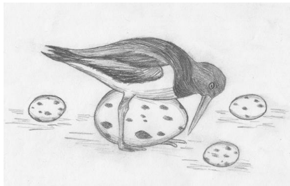
Figure 1. Oystercatcher. Drawing by Kerry Brock based on [4].

These mismatches can have a variety of proximal or at least more direct causes including: a) supernormal stimuli; b) the vast difference between the modern social context and that of our ecological and evolutionary past; and c) the fact that our brains did not evolve to deal with certain situations. First, let us consider supernormal stimuli. This concept was developed by Tinbergen [4] and explored by various others including Barrett [5]. A classic example is a shorebird, the oystercatcher ( Haematopus palliatus ) (Figure 1). If presented with an egg much larger than its own, an oystercatcher will ignore its own egg and attempt to incubate the completely inappropriate one, which it could not possibly have laid. In the human context, junk and processed foods with unnaturally high concentrations of sugar and other refined ingredients, or those that are artificially colored can be more stimulating physiologically and visually than natural foods [5, 6].