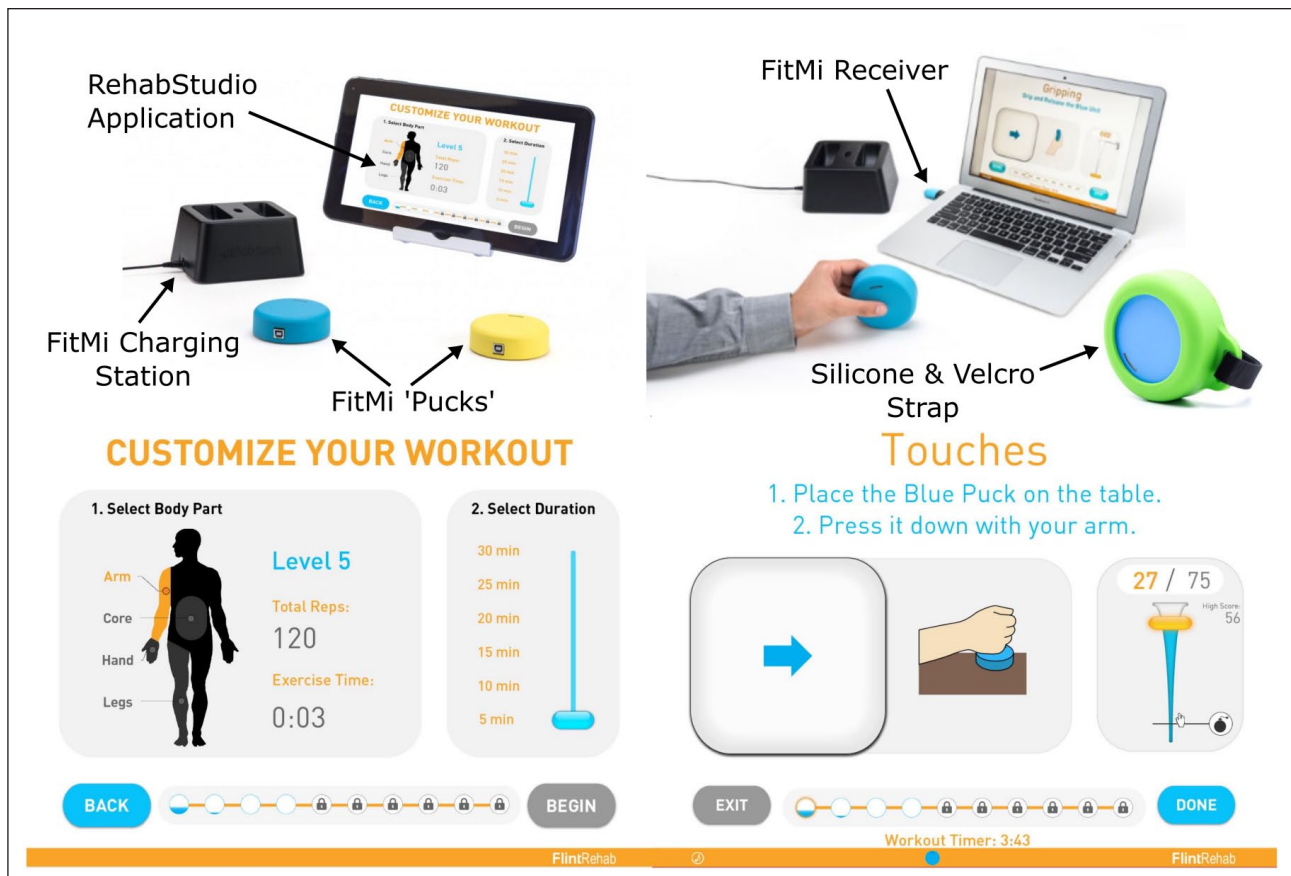
Figure 1. FitMi (produced by Flint Rehab, LLC) consists of 2 force and motion sensing pucks and a companion “mixed-reality gym” software application. Top row: FitMi hardware. Bottom row: FitMi software. Note, FitMi can be used with an individual’s existing computing hardware (Top Right) or with a custom 10” touchscreen tablet in a kiosk mode that only requires users to turn the tablet on and touch an icon to access the application (Top Left).

the age, ethnicity, and gender of the study participants to be representative of Los Angeles County in California, USA. All participants provided informed consent.