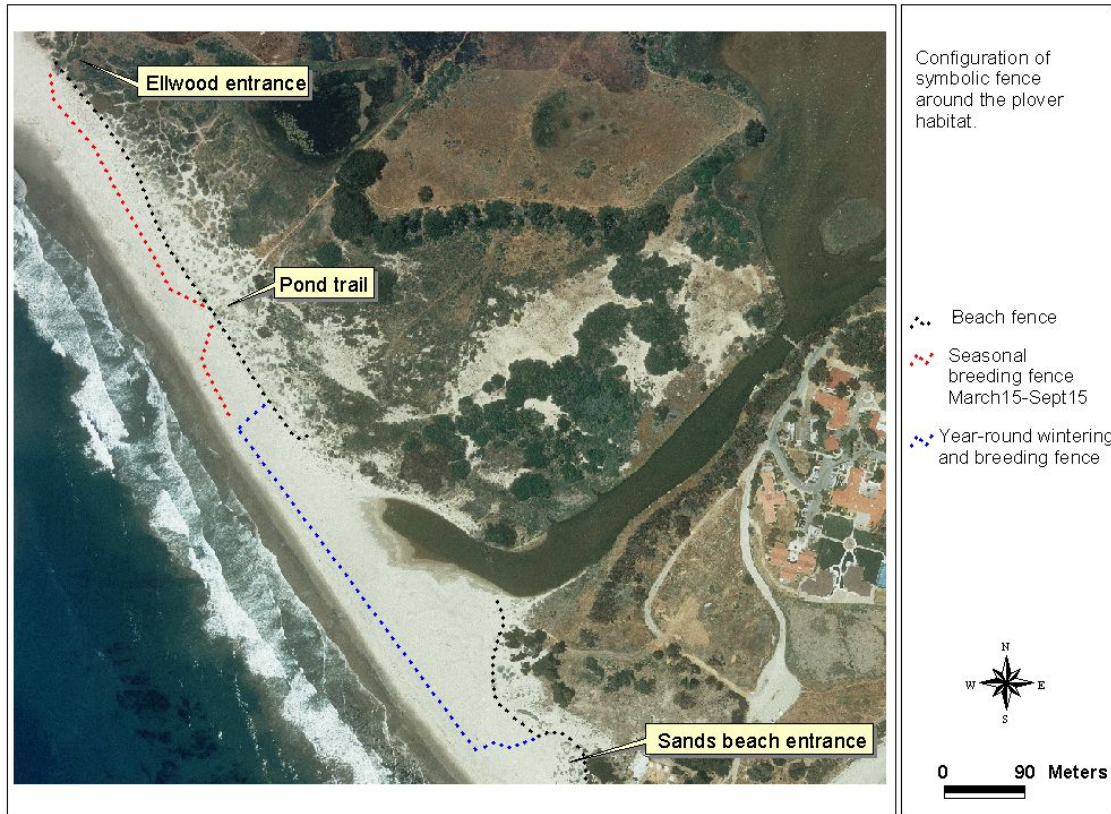
Figure 1. Location of the habitat protected for the Western Snowy Plovers on Sands beach at Coal Oil Point Reserve.