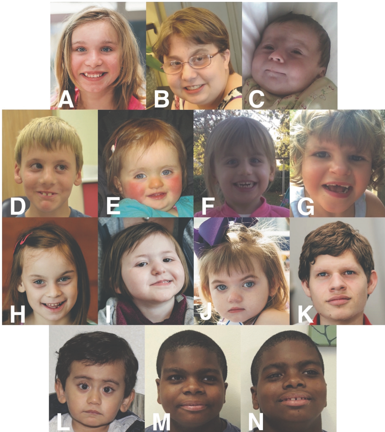
Fig. 1 Facial appearance of patients with haploinsufficiency of USP7 . While most individuals have facial dysmorphisms, including deep-set eyes and a prominent nasal septum, extending below the alae nasi, the dysmorphic features present across a varied spectrum and do not represent a recognizable dysmorphic condition at this time. (a) Patient 3. (b) Patient 7. (c) Patient 8. (d) Patient 10. (e) Patient 11. (f) Patient 13. (g) Patient 14. (h) Patient 15. (i) Patient 16. (j) Patient 17. (k) Patient 18. (l) Patient 19. (m) Patient 21. (n) Patient 22.

seven manifest characteristic facial features, and four of the eight manifest eye anomalies, namely strabismus, nystagmus, and anisocoria. Four of the eight were reported to have feeding difficulties requiring assistive techniques, with five of seven individuals having difficulty gaining weight, four of six