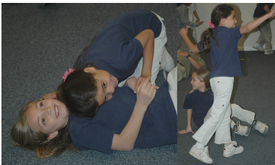
figure 5. Third graders listen to partner's heartbeat and dance to the rhythm of their heart.

At the start of the research, several of the older students dropped out of the iDA program perhaps due either to the dance content or to their feelings of vulnerability as a consequence of perceived overexposure by the medium. However the great majority of students were excited by the potential of the technology and eager to be connected to and seen by others. "It's like I'm a star on TV." One student discussed how the projection screen offered him a new perspective on his body. "It was so cool seeing myself moving. It was weird at first, but now I kind of like it. With the big screen copying my moves, I feel my dancing differently." The two age groups responded to VC differently. Intent on being seen by the teacher, the third grade students clumped together in front of the camera, while the older students congregated in the back of the room just out of range of the camera. As the VC sessions continued, the middle school students' shyness diminished, and their personalities began to emerge, while the third graders learned that the iDA teacher could see everyone in the class (figure 5-8).