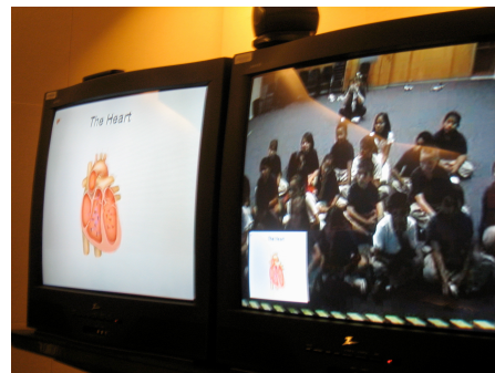
figure 6. Eloy Elementary School students view a PowerPoint lesson on the circulatory system.

A lack of personal connection hinders the formation of relationships and is particularly fragile within the context of VC, given the challenges of dropped