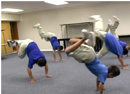
figure 7. Eloy Junior High School students practicing their choreography.

the teacher right next to you.” More interesting were the middle school responses with 40% preferring a VC dance teacher. One seventh-grader shared, “It is a lot like having the dance teacher right here. You just have to be active and participate more. We have to work hard to memorize the steps. With a VC teacher you can’t just dance it a little... you have to dance it fully.....” Addressing the anonymity that the distance provides, another student stated, “I [felt] more comfortable dancing when the teacher was far away.” Another discussed the accessibility found in VC: “When you are face to face, you feel kinda shy.... and it is kinda hard to look in their eyes and talk, but with VC it is easier to talk to the teachers.” Several of the older boys who had expressed concern with dancing, believing it to be “a lame activity,” ended up our most enthusiastic supporters.