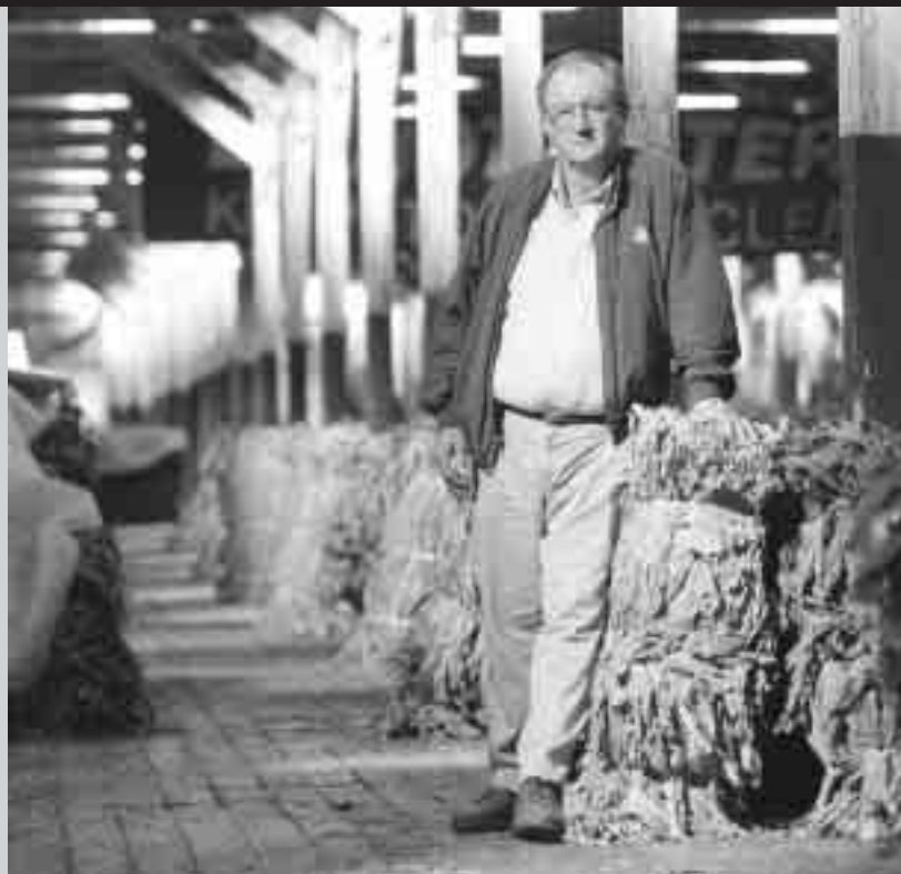
Big Shelby Tobacco Warehouse in Kentucky shut down sales in 2001 after 80 Years. The companies' move to the contracting system was blamed for the closure.

The number of tobacco farmers is dwindling. Between 1992 and 1997, the number of tobacco farms in the United States dropped 32 percent, even as production levels stayed the same. As small tobacco farms go out of business, their production is being replaced by larger, more mechanized farms. Between 1992 and 1997, the number of farms under 2 hectares fell 34 percent, to 56,285. Meanwhile, the number of tobacco farms of 20 hectares or more grew by 45 percent, to 3,769. 5