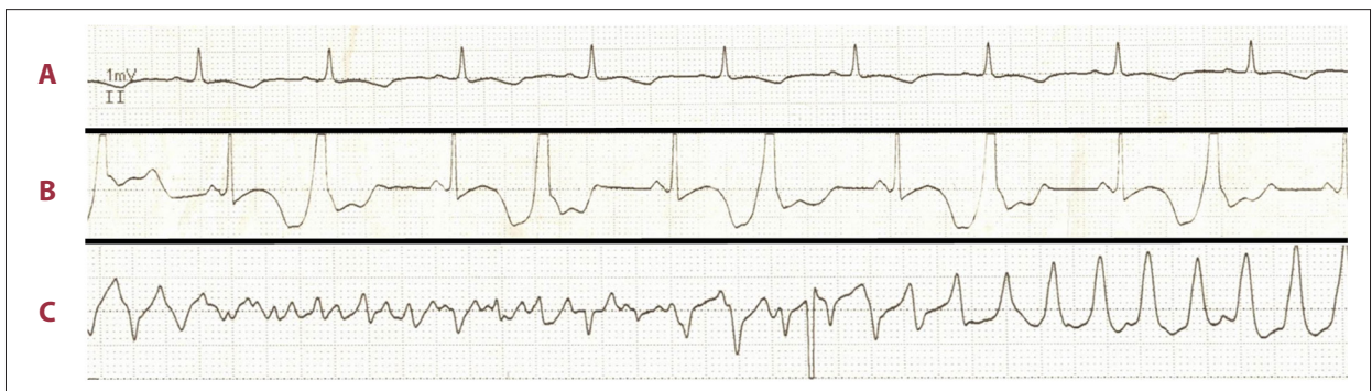
Figure 1. Electrocardiogram demonstrating the progression of the arrhythmia. (A) Sinus rhythm with prolonged QT interval. (B) Bigeminy. (C) Ventricular tachycardia with transition to torsades de pointes.

The child was admitted to the Pediatric Intensive Care Unit. He was monitored on telemetry, and defibrillation pads remained in place overnight. A transvenous single-chamber single-coil AICD was placed under general anesthesia the following day. The patient made an uneventful recovery and was discharged to home.