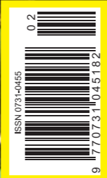
18.2 Media and the City

Volume 18, No. 2 $15 US $18 CA Summer 2006