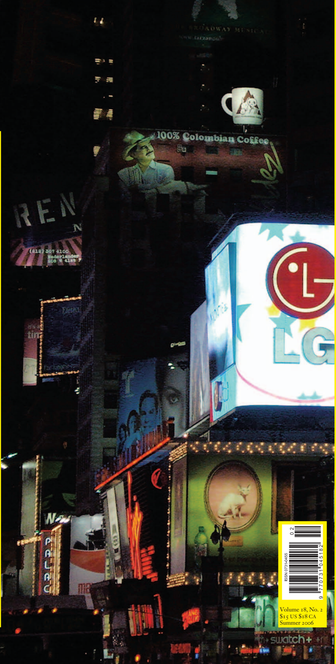
Places: Forum of Design for the Public Realm

Pratt Institute University of California, Berkeley College of Environmental Design ISSN 0731-0455 Made in USA www.places-journal.org