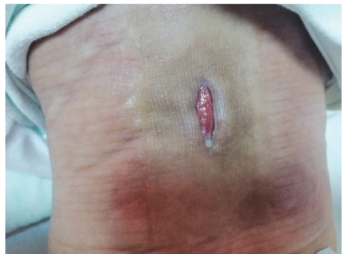
Figure 3. Clinical aspect after incision of the liquefied component of the median fat necrosis nodule.

Subcutaneous fat necrosis of the newborn is a panniculitis with a benign course that typically appears during the first 2–3 weeks of life in full-term or post-term neonates [1]. Risk factors include birth trauma, hypothermia, macrosomia, or other perinatal stress such as meconium aspiration, birth asphyxia, and maternal causes including pre-eclampsia and diabetes. Typical forms of SCFN are characterized by purplish-erythematous subcutaneous nodules and indurated plaques [1]. Lesions are mostly located on the posterior trunk, thighs, proximal extremities, and cheeks. Spontaneous resolution without sequelae is the rule; it may take weeks to months [1,2]. Unusually, we can have liquefaction or ulceration of nodules [3]. Some