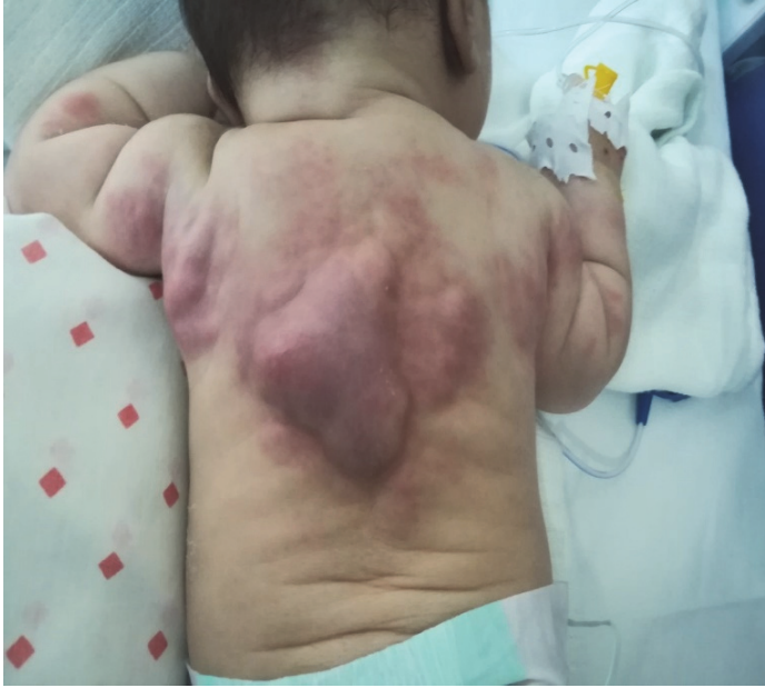
Figure 1. A large liquefied component of one plaque on the back, 6cm×10cm in size.

discomfort and the lack of regression of the very large plaque. It allowed the draining of about 20 ml of thick liquid. Samples of the fluid were sent to the laboratory of bacteriology and anatomic pathology. Blood cultures were sterile. On the seventeenth day of life, biological monitoring revealed persistent thrombocytopenia and hypercalcemia with a serum level reaching 2.85mmol/L. It was treated with low calcium and vitamin D intake and hyperhydration. The triglyceride level was normal at 2.1mmol/L. The