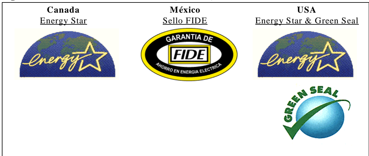
Figure 1. Endorsement Labels in Canada, México, and the United States

Comparative labels offer consumers information that allows them to compare performance among similar products, using either discrete categories of performance (or efficiency) or a continuous scale. Energy consumption and/or cost also may be shown on the