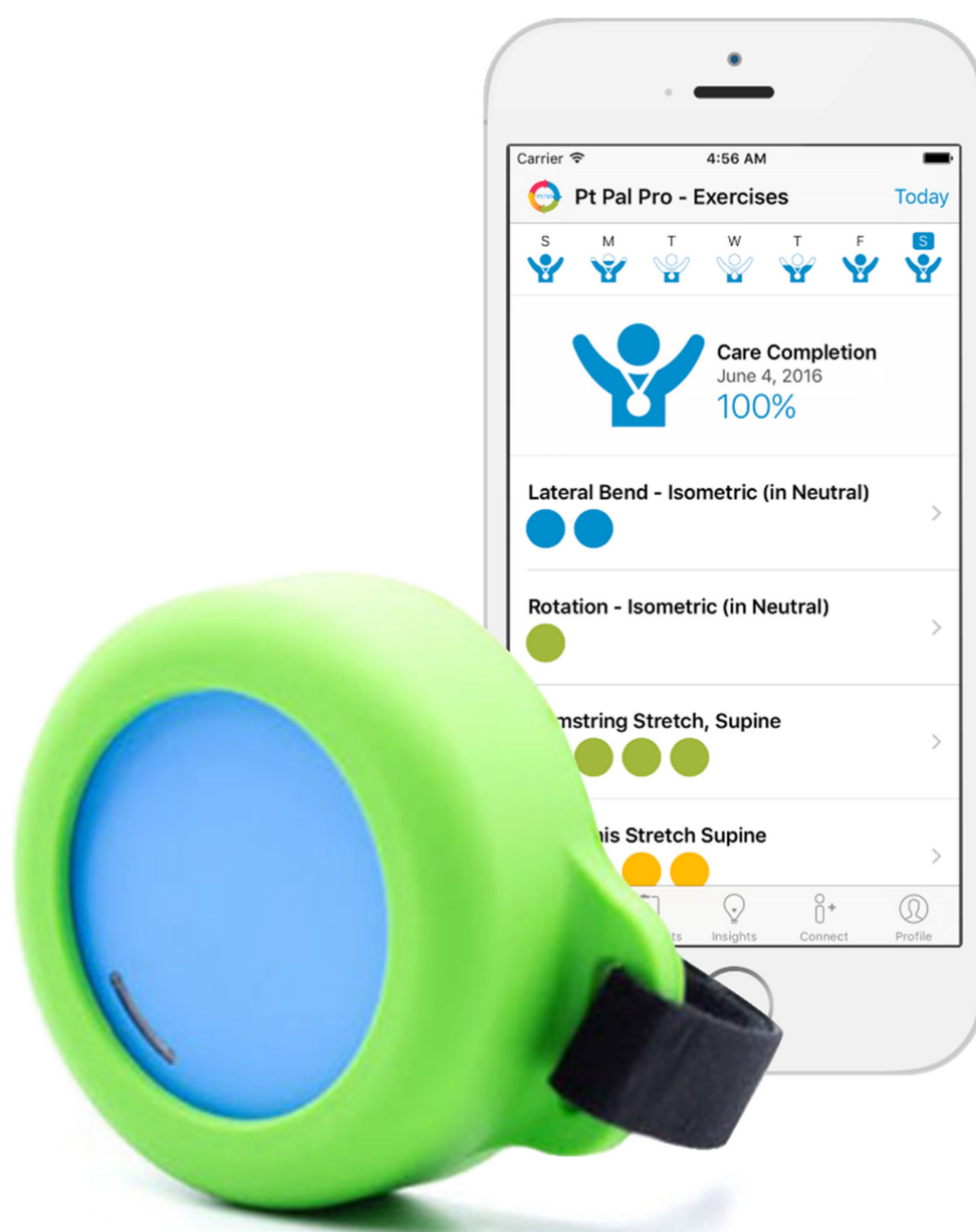
Figure 1. FitMi sensorized puck (blue) and silicone–Velcro strap (green) and Pt Pal patient app. The puck can be held and moved, squeezed, placed on a table or the floor and pressed, or strapped to a limb.