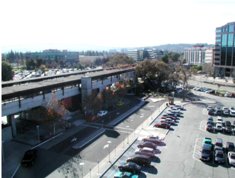
FIGURE 1 Current site conditions, Pleasant Hill BART station.

The EasyConnect field operational test was launched in August 2005 to introduce shared-use electric bicycles, non-motorized bicycles, and Segway HTs (known as the “low-speed modes”) at the Pleasant Hill BART station. See Figure 1 below for a photograph of the existing Pleasant Hill BART station. The field test is designed to appeal to those who would like to take BART to commute to work, but are stymied by the inevitable “last-mile” problem.