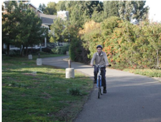
FIGURE 2 Bicycle rider in Pleasant Hill.

There is an extensive paved trail network in the Pleasant Hill BART area. The East Bay Parks District has granted permission to the research project to use the Iron Horse and Canal trails for “non-motorized” trails for the purpose of this program. Access to the trails greatly enhances the BART, employment, and shopping connections. See Figure 2 of rider on a bicycle trail in Pleasant Hill.