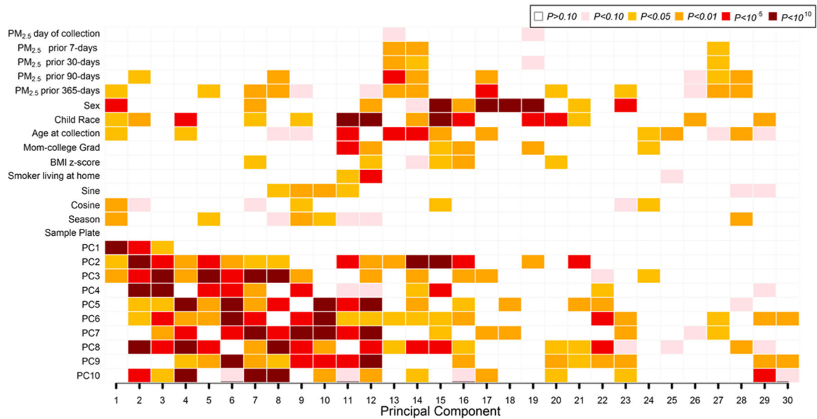
Fig. 1. Associations of PM 2.5 exposures, participant characteristics, and cell type heterogeneity with Global Nasal DNA methylation (DNAm) variability. PCs 1–10 on the vertical axis reflect DNAm differences in cell types estimated using the bio-informatic method ReFACToR. Univariate regression analysis (with global DNA methylation principal components as outcomes) was performed. P values for univariate associations between all covariates of interest and the top 30 global DNA methylation PCs (shown on the horizontal axis) are color-coded by smallest P value (dark red; P < 10^{-10} ) to largest (blank; P > 0.10 ). In all, global DNA methylation principal components explained 59% of the variance of the nasal DNA methylation data in the x-axis.