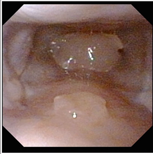
Figure 1 Before debulking, a large cryptococcal granuloma was noted arising from the floor of the nasopharynx, on the anterior-most aspect of the soft palate. Dorsal to the larger lesion was a smaller, similar appearing lesion, likely also a fungal granuloma. In these retroflexed endoscopic views, ventral is at the top of the image and the left side of the patient is the right side of the image

through both nostrils was noted. Tests for feline leukemia virus antigen and feline immunodeficiency virus antibody were negative (IDEXX FeLV RealPCR Test/IDEXX FIV RealPCR Test).