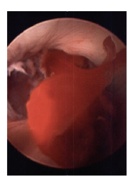
FIGURE 1: Intraurethral arterial bleeding.

2.3. Patient #3. Patient #3 is a 17-year-old otherwise healthy male with history of obstructive urinary symptoms who was