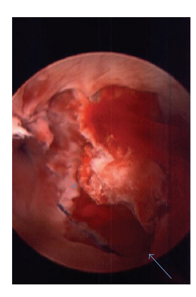
FIGURE 2: Ventral anastomotic disruption; distal end (solid arrow) and proximal end (dotted arrow) of anastomosis.

(laparoscopic) applicator under direct visualization into the area of the mucosal opening. After a total of 8 cc of fibrin glue was injected, the bleeding stopped. He was discharged from the hospital 2 days later with a 16 F catheter in place.