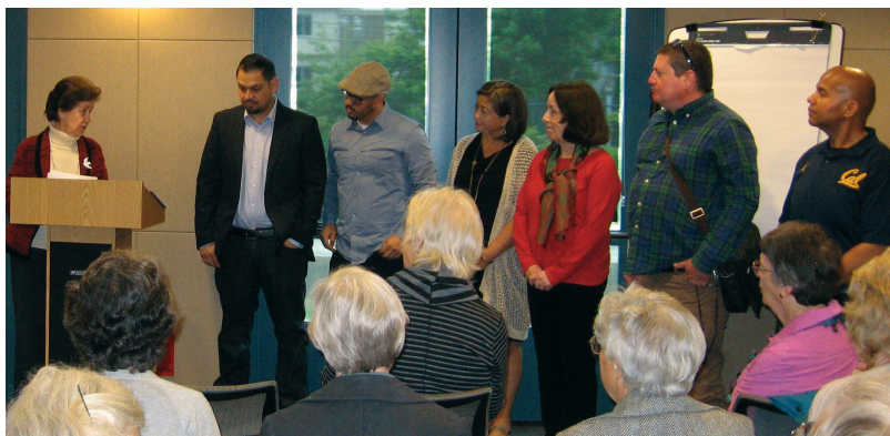
University of California, Berkeley liaisons accepting S.O.S. grants.