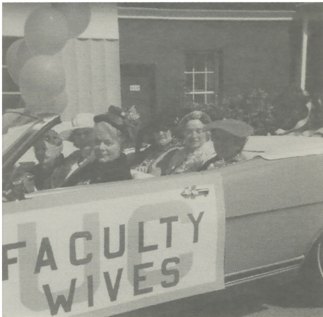
Section Club entry in City of Berkeley Centennial Parade, 1978. Section Club Papers, University Archives.

Since its founding in 1927, the watchword of the University Section Club has always been and always will be 'Welcome.' It is a wide embrace, reaching every corner of the Cal community, cultivating friendships and mutual interests as well as offering service to both individual students and to the larger institution. This small publication is the club's effort to honor over ninety years of accomplishments. With generosity, creativity and energy, our members have responded to the ever changing, ever challenging needs of Berkeley. It is time to celebrate our story.