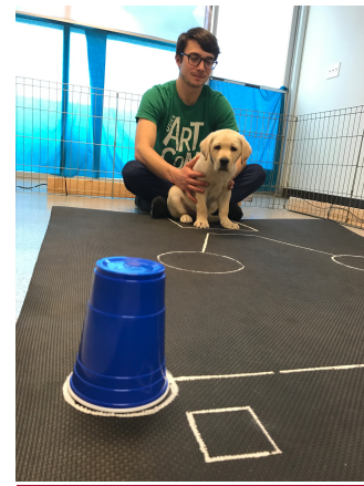
Figure 2: Dog and cup setup.

are not presented in this paper. After participating in these social cue tasks, dogs participated in the odor control task which is the focus of the current study.