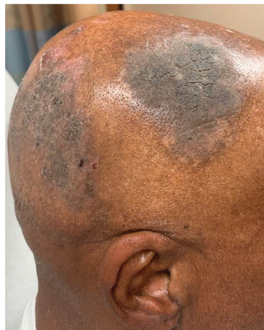
FIGURE 4 Mounded and refractory keratoses as an early presentation of pemphigus vulgaris recurrence. In this patient (Case 3), there were no blisters present on the body or scalp.

immunofluorescence (DIF) revealed weak intercellular and junctional IgG and C3, evoking consideration of pemphigus. Repeat DIF testing from another scalp biopsy demonstrated similar equivocal results. A diagnosis of PV was finally established after indirect immunofluorescence (IIF) returned positive for intercellular substance (1:160); serum IgG levels were not obtained. He was then started on oral prednisone and intravenous immunoglobulin (IVIG) was thereafter added. He