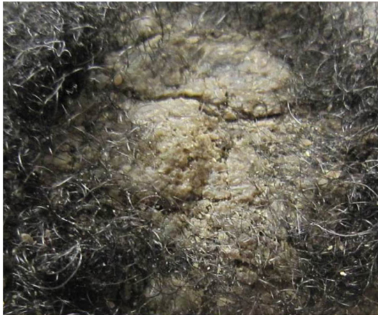
FIGURE 1 Mounded and refractory keratoses, an atypical presentation of pemphigus vulgaris affecting the scalp. Presentations can include brown–gray mounded scales with or without the crust.

being a dermatologic disease of historic significance, this particular presentation remains underrecognized.