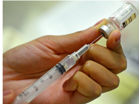
Figure 1. The MMR vaccine. 17 Studies indicate that some parents are still hesitant to vaccinate their children.

Researchers have made significant progress in determining what constitutes a high-risk mutation. One study has identified 107 high-risk genetic mutations that occur amongst 5% of autistic subjects. 10 Both genetic factors and environmental factors account for the development of ASD, but genetic factors currently offer more potential for medical treatment. Hence, characterizing the relationship between what ASD-linked genes encode and how these genes are expressed phenotypically is the next challenge scientists face in determining how to medically treat ASD.