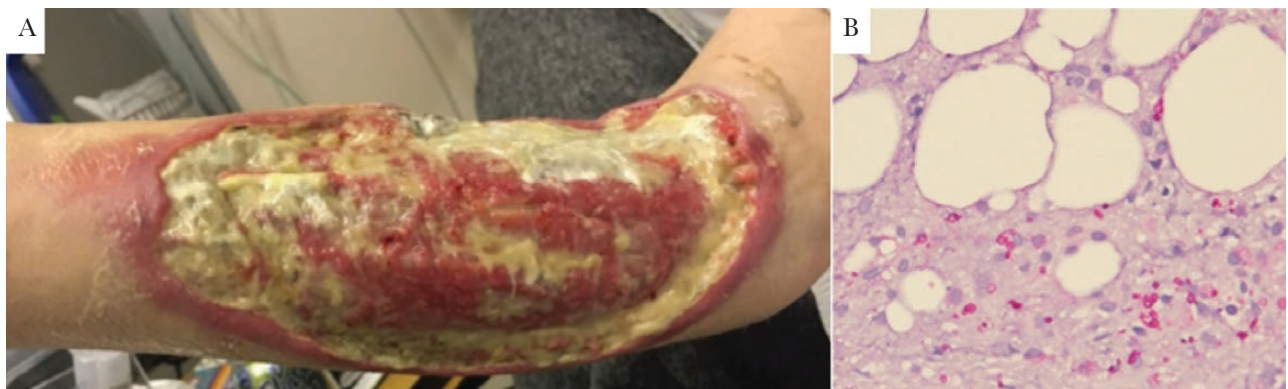
Figure 2. A, Right upper extremity lesion after second debridement surgery. Significant full-thickness ulcer with erythematous, undermined borders covers most of forearm. Yellow material is a combination of fibrinous debris and gel wound dressing. B, Biopsy sample demonstrating PAS-D staining of yeast surrounding subcutaneous arterioles.

Sporotrichosis classically presents in a lymphocutaneous pattern with distal to proximal spread from the inoculation site [2]. Typically, disseminated disease occurs in hosts with severe immunocompromise including those with HIV or hematologic malignancies. However, even immunocompetent hosts, especially those with heavy alcohol intake or poorly controlled diabetes, can develop both lymphocutaneous and disseminated disease (Table 1) [5]. Dissemination occurs in ~1% of cases [6], presenting with cutaneous features that include numerous nodules that often ulcerate [7]. Osteoarticular involvement is a common feature of disseminated disease, usually manifesting as large-joint monoarthritis [1]. Diagnosis is often delayed because symptoms mimic other conditions including PG, Sweet's syndrome, tuberculosis, sarcoidosis, and other mycotic or parasitic infections, including cutaneous leishmaniasis [8]. Indeed, Sporothrix is a common infectious mimicker of PG and can lead