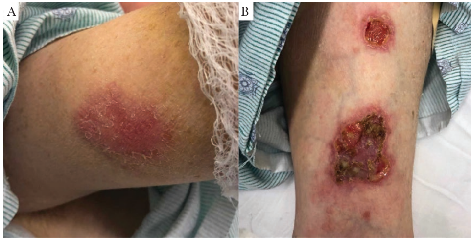
Figure 1. Skin lesions. A, Indurated, erythematous subcutaneous nodule with overlying scale on the right upper arm, representative of the early stages of evolution of these skin lesions. B, Left wrist exam, showing ulcerations with violaceous to erythematous undermined borders and a fibrinous base.

She was re-induced with amphotericin (4 mg/kg daily) for 3 weeks and then changed to oral posaconazole (300 mg once daily) based on initial sensitivity data (posaconazole minimum inhibitory concentration, 0.5). She remains on posaconazole 12 months after initial presentation, with no evidence of recurrence.