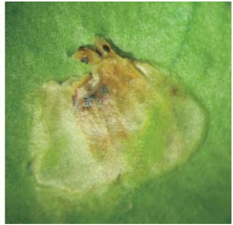
Imidacloprid kills GWSS nymphs as they try to emerge from the egg case.

pyrethroids and systemically applied neonicotinoids were the most effective against the adult stage, limiting their survival and ability to deposit eggs. These insecticides should be used as the first line of defense. Any insecticide that eliminates adults is likely to also eliminate emerged nymphs, because of their smaller size. Sometimes, GWSS adults are able to deposit eggs before the insecticides kill them (table 2). The carbamate carbaryl and the foliar neonicotinoids imidacloprid (Provado) and acetamiprid were highly effective in preventing nymphs from successfully emerging from egg masses.