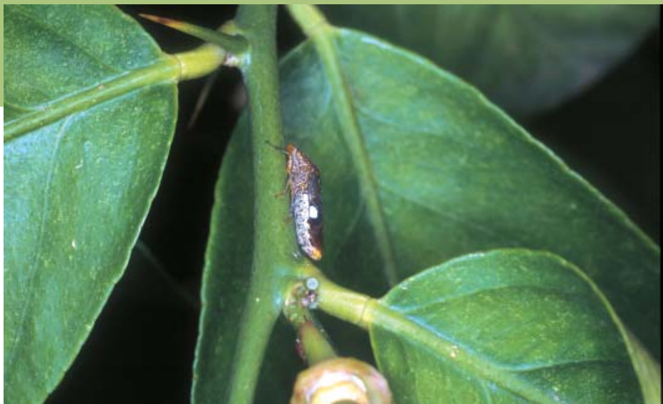
The glassy-winged sharpshooter (GWSS) was recognized as a serious insect pest in California in the mid-1990s. Subject to quarantine restrictions, nursery citrus is usually treated with insecticides to prevent the transport of GWSS throughout the state. Above, A GWSS adult rests on a citrus stem.

G lassy-winged sharpshooter (GWSS), a nonnative insect, arrived in Southern California prior to 1990 (Sorenson and Gill 1996). However, it was not until the late 1990s that the serious nature of its potential as a vector of Xylella fastidiosa , the bacterium that causes Pierce's disease in grapes, was recognized in California. From 1997 to 2000, the number of grapevines infected with Pierce's disease in Temecula, Calif., rapidly escalated from a small number to thousands (Blua et al. 1999). This epidemic pointed out to the grape industry the seriousness of GWSS as a vector of Pierce's disease.