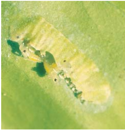
GWSS nymphs as they emerge from the egg case.