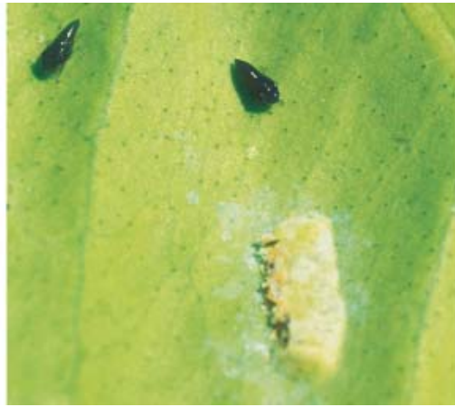
The nymphs turn a dark color and develop legs soon after emergence.