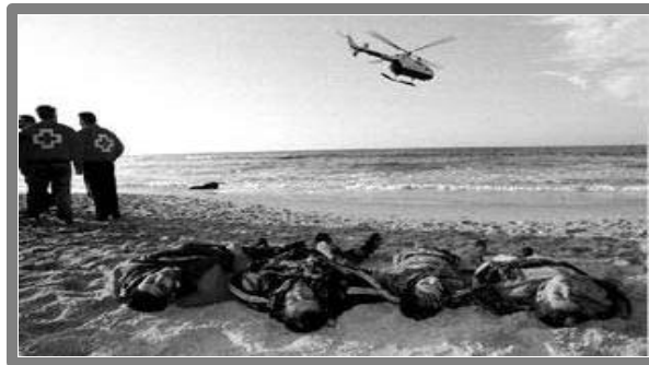
Immigrants landing from the pateras (1998-2001)

European Union. Turns that have had an strong impact on the current particular immigration 'police approach'. Besides, this 'electoralization' of the immigration issue and its persistent thematization in the public discourse has had a direct, negative (and from my point of view, a deliberate) effect on the mass-media as well on the public opinion regarding immigration and the immigrants. For example, almost everyday one can see in the daily news or in the newspaper the image of the 'pateras' 4 or the capture of undocumented immigrants. Or, for example, if we check the newspaper by internet, almost all of them have a special section called 'the immigration problem'. This was something unimaginable seven years ago, when immigration was not a matter of such large interest.