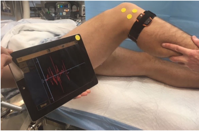
Figure 2. The KIRA inertial sensor system for quantifying lateral tibial acceleration during the pivot-shift test.

unidirectional force in a single plane, such as the Lachman test and the anterior drawer test. The IKDC Knee Ligament Standard Evaluation Form provides a standardized classification of the degree of AP translation. 45 For instrumented quantitative assessment of AP laxity, the KT-1000/2000 arthrometer (MEDmetric Corp) 27 and the Rolimeter (Aircast) 8 provide among the most accurate measurements, although the intraclass correlation coefficient is variable according to the literature, and the results are examiner dependent. 88 Another instrument is the GNRB (Genourob), which is a robotic arthrometer developed to alleviate the difficulties with examiner-dependent measurements. The patient's leg is placed in the robotic system, and a predefined force is applied to the proximal calf, while the relative displacement of the anterior tibial tubercle with respect to the patella is recorded by a displacement sensor. The GNRB also offers the advantage of using electromyography sensors to record hamstring activity to detect incomplete hamstring relaxation that affects the result. 89 Static AP measurements do not necessarily correlate with clinical outcome and function, 7,57,58 which indicates that laxity assessment should not solely rely on static AP translation because it fails to capture the more complex knee kinematics.