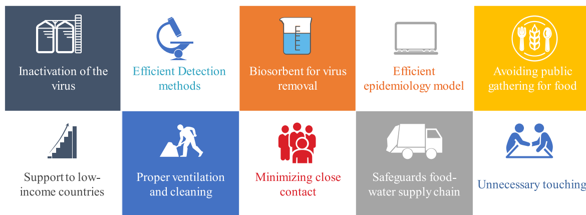
Fig. 3. Methods of preventing SARS-CoV-2 transmission through water-food-environment compartments.

its presence in both wastewaters, rivers, and other environmental compartments. Although the current knowledge indicates the genetic material of the virus is non-infectious and harmless while also demonstrated more stability than the infectious virus, especially under lower temperature (Hokajärvi et al., 2021), the health implication of ingesting SARS-CoV-2 RNA excessively should be thoroughly investigated. Besides, a study had proposed the infectivity and transmission potential of these RNAs (Xu, 2020), since the viable proportions from the measured viral load of the SARS-CoV-2 RNA are often not measured.