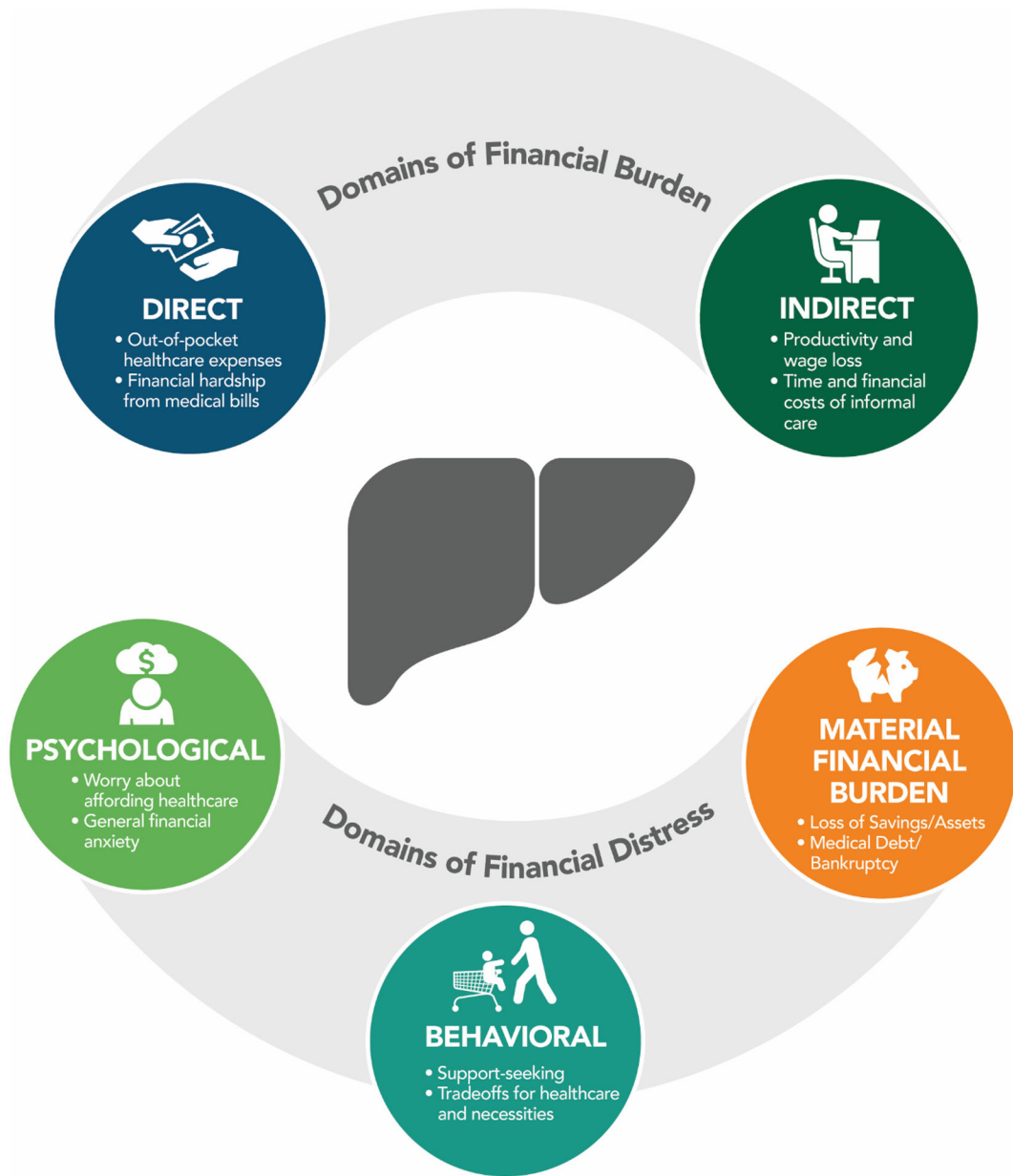
Figure 1: Domains of Financial Burden and Distress in Chronic Liver Disease Care.