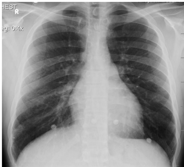
Figure 2. Repeat chest radiograph shows resolution of infiltrates and edema of Patient 1.

edema and chemical pneumonitis improved with supplemental oxygenation and methylprednisolone 125 mg IV once daily. He did not require additional doses of diuretics.