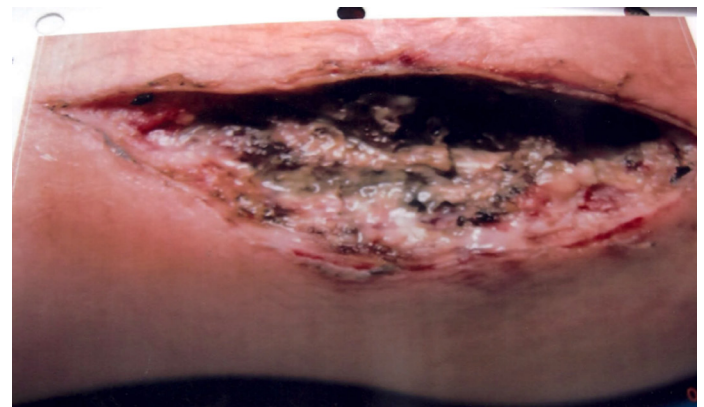
Figure 4. Fasciotomy of forearm shows diffuse fat necrosis of Patient 2.