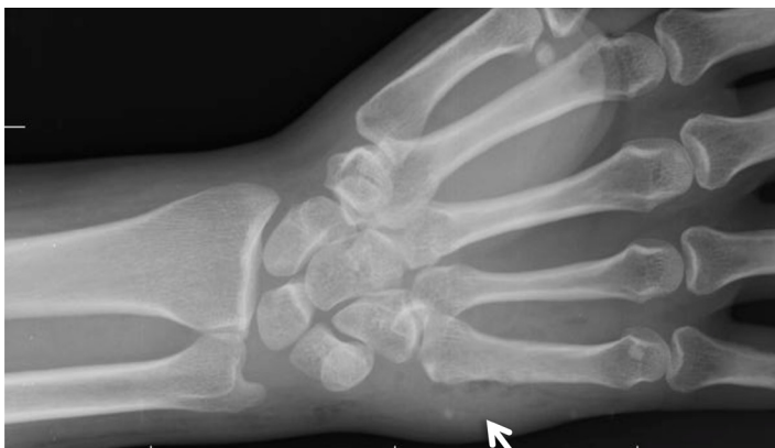
Figure 3. Right upper extremity of Patient 2. Wrist radiograph demonstrates subcutaneous emphysema (arrow) extending from injection site and hand down to forearm.

He developed cellulitis of the right upper extremity near the injection site in the right antecubital fossa on the second hospital day and was started on 1 gm of vancomycin and 3.375 gm piperacillin/tazobactam. Repeat laboratory studies on hospital day 2 demonstrated increasing leukocytosis with WBC 16.4 k/mm 3 with 5% band neutrophils and 76% segmented neutrophils. The cellulitis progressed into an abscess and on hospital day 7, the patient was taken to the operating room for incision and drainage. The procedure demonstrated liquefied necrotic subcutaneous tissue, which was debrided and excised, and the wound was packed with iodoform gauze. Culture of the abscess revealed no growth of any organisms. After incision and drainage, the patient improved clinically with reduction in pain and redness in his right upper extremity. CXR findings resolved (Figure 2) by hospital day 3, and he was discharged after 9 days to inpatient psychiatric care.