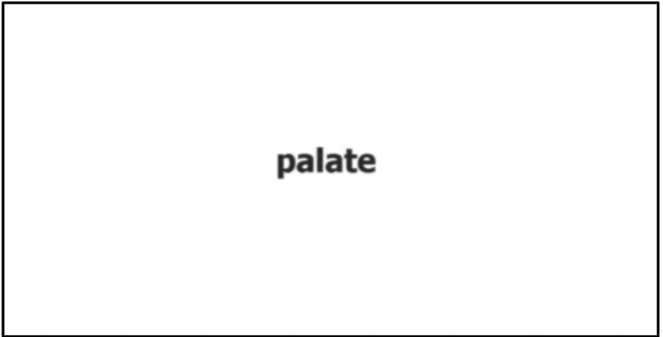
Fig. 2. NIH Toolbox Oral Reading Recognition Examinee Screen (National Institutes of Health & Northwestern University, 2006–2012b).