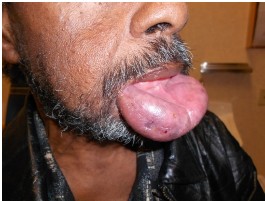
Figure 1. Granulomatous cheilitis in the lower lip