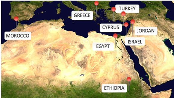
Figure 1: At-risk cultural heritage sites included in the project.

digital cultural heritage system can benefit underfunded California institutions and national and international cultural organizations. For example, the California Department of Parks and Recreation is desperately trying to preserve the many crumbling Spanish missions or gold rush era mining town (e.g. Bodie State Historic Park), a documentation and awareness effort that 3DP-ARCH project technology and experience can help.