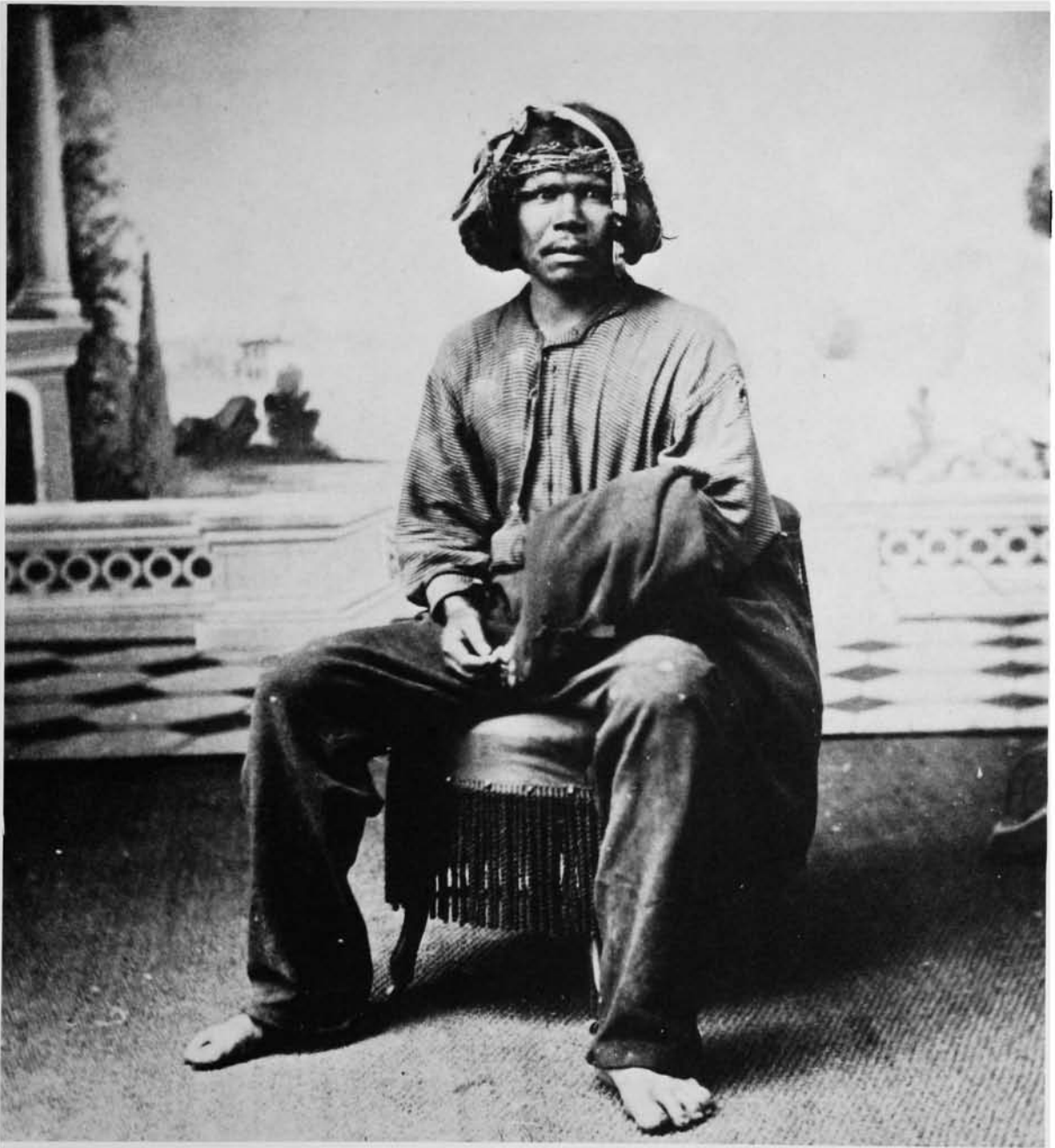
Fig. 1. Miwok man, Sonora, California, ca. 1856-1860. This and the following four images are each one side of the stereographic views made by Rulofson & Co., a Sonora, California, photographic firm.