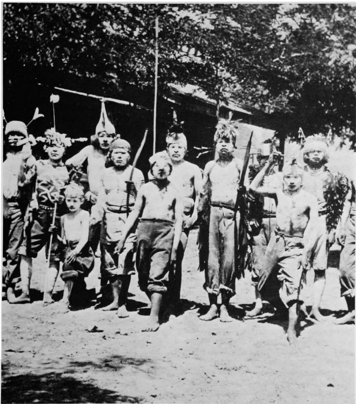
Fig. 5. Miwok dancers on Washington Street, Sonora, California, ca. 1856-1860. Note that these dancers also appear in Fig. 4.