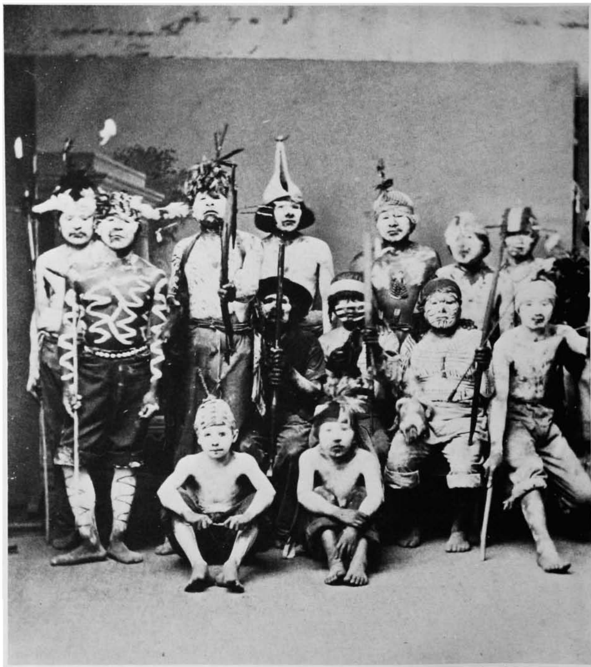
Fig. 4. Miwok dancers, Sonora, California, ca. 1856-1860.