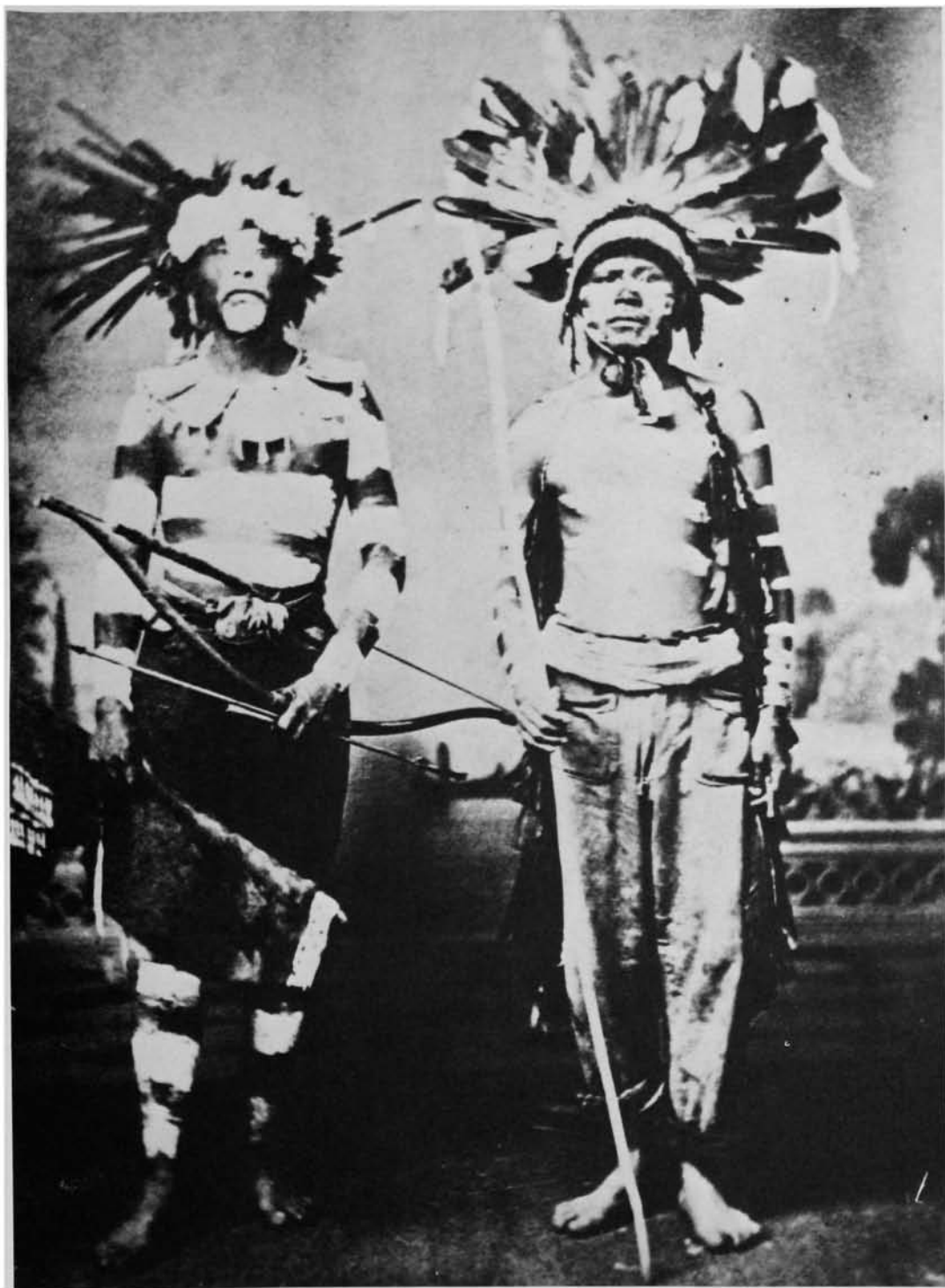
Fig. 3. Two Miwok dancers, Sonora, California, ca. 1856-1860.