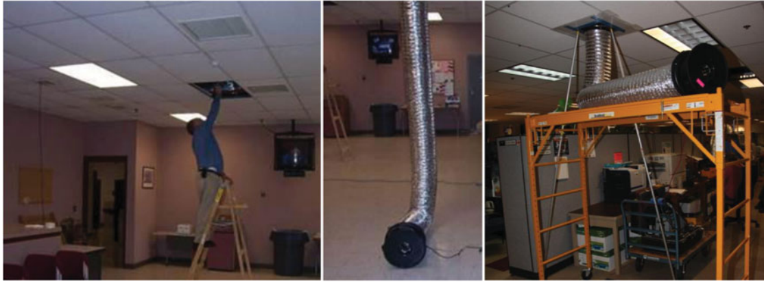
Fig. 1. Example field application of modified fan pressurization protocol. VAV box inlet damper is being closed manually on the left, and the pressurization fan with integrated flow meter is attached to a supply diffuser two different ways in the two pictures on the right.

through the inlet damper, Equation 3 can be used to solve for the test section leakage flow: