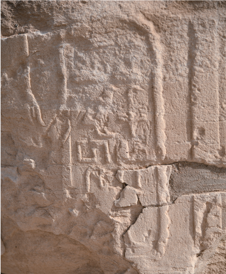
Fig. 5. Cartouche of "land of the nomads of yhw ."

the Semitic gods and goddesses. 27 Although Anat was worshipped in Egypt during the New Kingdom, because of the bt (house of) modifier, and the association with a ššw group outside of Egypt, perhaps a deity determinative should not be expected. Yet, due to the damage on this section of the pillar, it is not beyond the realm of possibility that a ntr or goddess sign was originally present following the name. Overall, the case for references to deities and personal names rather than cities or towns on this particular pillar is compelling.