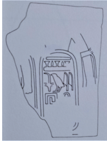
Fig. 7. Drawings of SB 69, from SCHIFF GIORGINI et al., Soleb V .

fied from fragmentary wall blocks from the interior of the temple found during excavations – the \text{\$3sw} of yhw3 and the \text{\$3sw} of pt ys . 39 Both of these blocks were from the wall of the temple Sector III, 2nd court. On block II 79 of Soleb is the phrase t3 \text{\$3sw pt ys} . 40 Block SB 69, Sector III, 2nd court, is a fragmentary wall block which was part of a larger relief showing subdued or conquered people and places. 41 The location, R38, is in the north aisle of the east portico. The fragmentary inscription of SB 69 was found during excavations of the temple, then along with several other architectural fragments it was placed in storage off-site, but kept in Sudan rather than added to the Egyptological collection at the University of Pisa. 42 Now it seems to be in the possession of the department of antiquities in Sudan. On block II 69 of Soleb is the same phrase t3 \text{\$3sw yhw3} . Although this phrase is identical in word order and meaning to the relief on Column IV N4, the facing of the hieroglyphs is opposite. While a drawing was made of the inscription on SB 69, unfortunately no high-resolution photograph is known to exist.