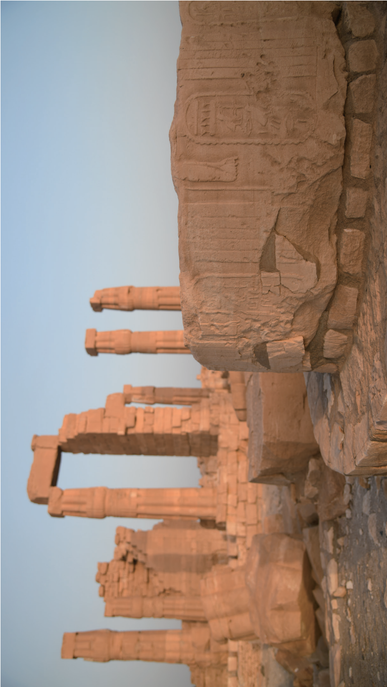
Fig. 1. The Temple of Amun-Ra at Soleb.