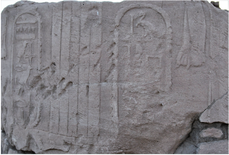
Fig. 3. Cartouches of twr hyl and bt ʕnt .

ence to the West Semitic deity Ba'al Hadad, who was considered king of the gods in Ugaritic and Canaanite texts and identified with the bull (Semitic twr ) in both iconography and texts. This name has also been given a suggested geographical link east of Egypt but in northern Canaan, with the name Terbol or Turbul, located either in the Beqa Valley of Lebanon or slightly farther north. 18 There is a town named Terbol (or Turbul) nearby Jebel Turbul in the Beqa Valley east of Beirut, but connecting this geographic name with the Egyptian topographic list rather than the ancient Semitic name relating to the deity is a hypothesis which cannot be supported archaeologically.