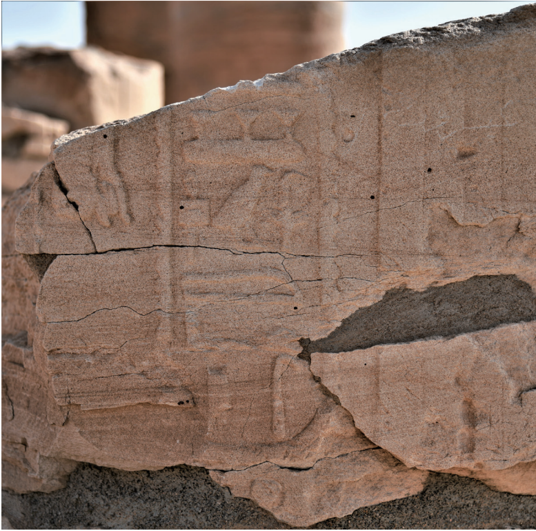
Fig. 4. Cartouche of smt .

ing name with many possible options. Could this refer to Setem, a god of healing, altered through metathesis? Or a shortened form of Shemat-Khu, a goddess of the underworld? Or perhaps a lesser Semitic deity that is not currently known from ancient inscriptions? The name smt has been suggested as a location called Samat, a site on the Phoenician coast about 7 miles south of Batrun. 20 However, there is also an unexcavated site called Khirbet Deir Samat in southern Canaan between Gaza and the Dead Sea, west of Hebron. 21 Yet, against the identification of smt as a geographic location, and particularly against a settlement since this is a nomad group, is that smt appears to be followed by either a “throwstick” (T14) or “peasant’s crook” (S39) determinative, which indicates that this particular name is a foreign tribe – perhaps named after a leader or ancestor. 22