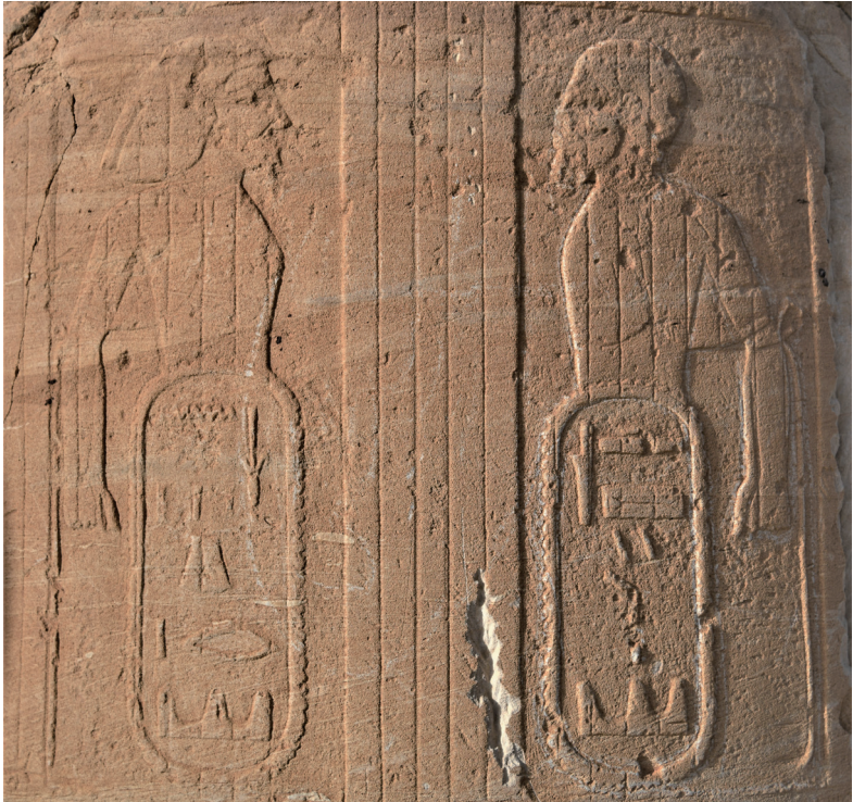
Fig. 2. Bound prisoner reliefs at the Soleb temple.

separate lists at Soleb – one cut into a wall and the other inscribed on a pillar, found at the famous temple dedicated to Amun-Ra and commissioned for building by Pharaoh Amenhotep III. 12 The earlier Soleb list, from which a portion of the Amara West list may have been copied, was uncovered during the Schiff Giorgini excavations at Soleb, beginning in 1957. These even earlier inscriptions from the reign of Amenhotep III also referred to the “land of the nomads of yhwt .” Publications in the past have generally only referred to the pillar, but in addition to the pillar relief in the hypostyle hall, a fragmentary wall list also contains a similar inscription mentioning the “land of the nomads of yhwt .” 13