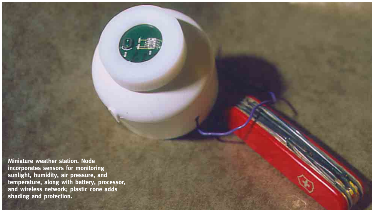
Miniature weather station. Node incorporates sensors for monitoring sunlight, humidity, air pressure, and temperature, along with battery, processor, and wireless network; plastic cone adds shading and protection.

Sensor nodes are small (only a few inches around) battery-powered devices installed in the areas of interest. A typical micronode is built around a low-power microcontroller running at a few MIPS with a few kilobytes of RAM. The sensing elements take the form of a probe connected to a general-purpose signal-acquisition board or are integrated into the packaging with microcontroller and wireless transmitter. Certain applications (such as acoustic bird-call classification) require macrosensors with additional computing power and storage. A typical macrosensor offers at least 10 times the capability—in terms of