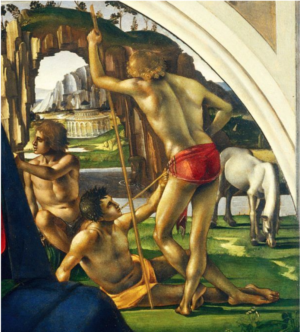
Fig. 3. Luca Signorelli. Madonna and Christ Child (detail), oil on wood, c. 1490, Galleria degli Uffizi.

relations. 77 In Signorelli's aforementioned Uffizi tondo (Fig. 3), the two male figures on the right are particularly suggestive.