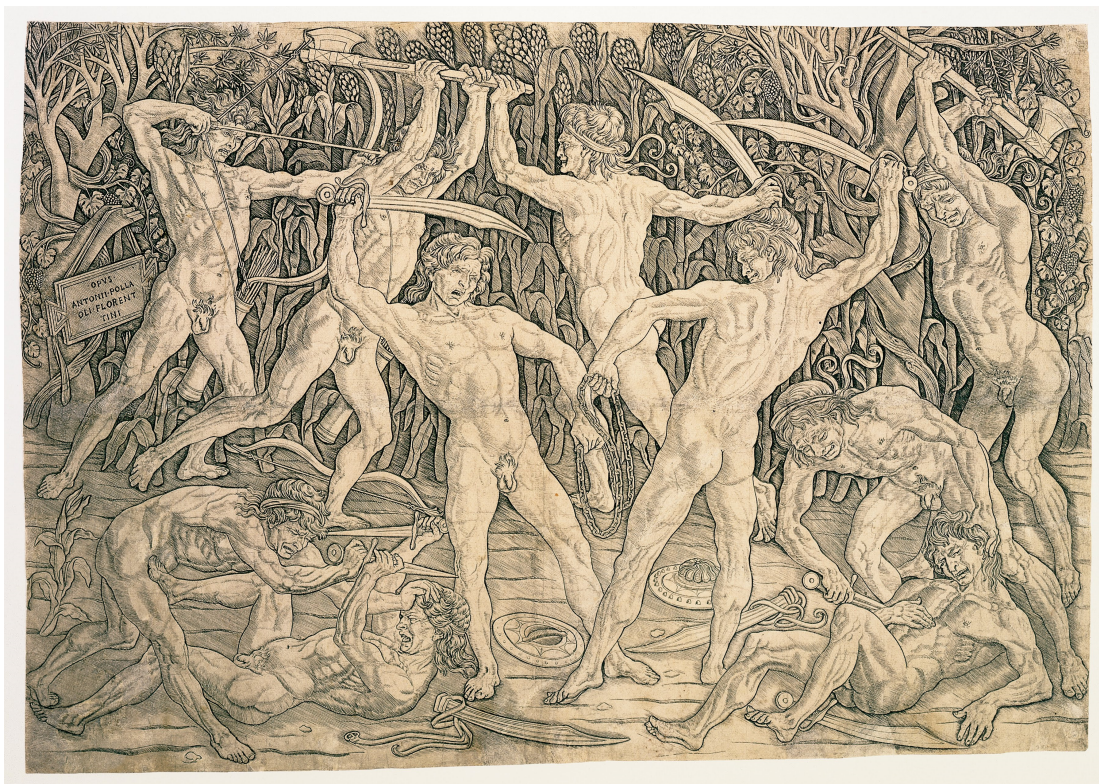
Fig. 2. Antonio Pollaiuolo, Battle of the Nude Men , engraving, 1465–1489.

Martelli has suggested that we see in the Brera standard the influence on Signorelli of his teacher Piero but also of Bartolomeo della Gatta, 43 and of Florentine artists including the sculptor Verrocchio (whose workshop is regarded by most Renaissance scholars as the greatest of the 1400s) 44 and the Pollaiuolo brothers. 45 Martelli specifically credits Antonio Pollaiuolo with providing the inspiration for Signorelli’s depictions of the male bodies (in particular, via Antonio’s Labors of Hercules ), and Piero for the striped sashes worn by Christ’s tormentors. Antonio Pollaiuolo’s most famous engraving of male figures, the Battle of Ten Nude Men (Fig. 2), has been assigned a range of dates, some of them subsequent to Signorelli’s Brera Flagellation . (The recent Pollaiuolo show at Milan’s Museo Poldi Pezzoli dates it 1485, for example, while Olszewski dates it c. 1489). 46