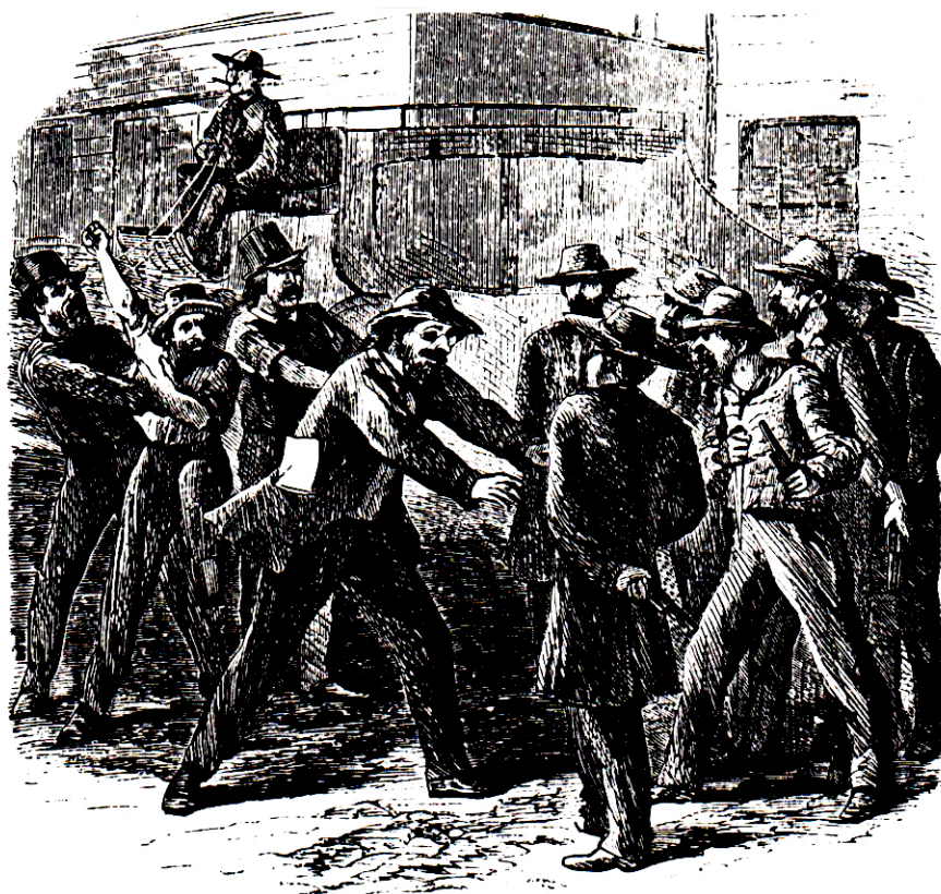
THE AUTHOR'S RECEPTION ON HIS RETURN TO VIRGINIA CITY