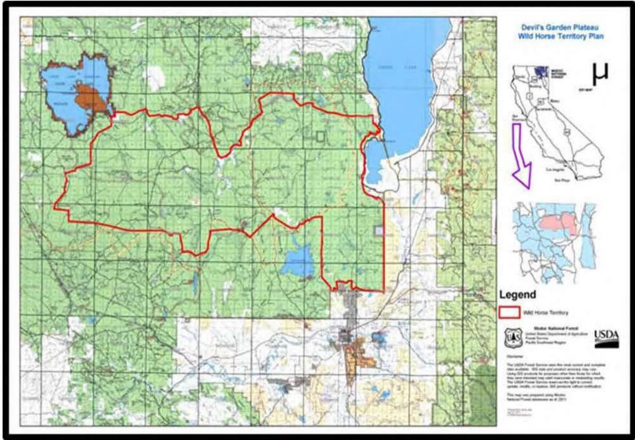
Figure 1. Map of Devil's Garden Plateau and surrounding area. Adapted from USDA 2013.