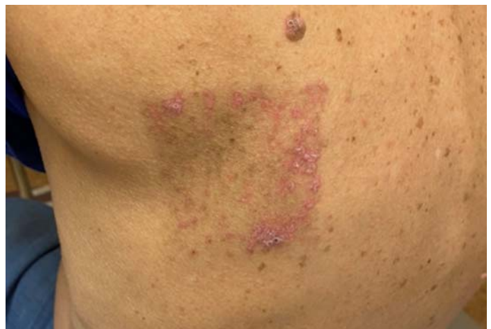
Figure 1. Coalescing erythematous-to-violaceous scaly papules localized to a well demarcated hyperpigmented patch at the site of previous radiation therapy on the back.

received palliative radiation to the left side of his back for bony metastases a few months prior to starting pembrolizumab immunotherapy for treatment of his malignancy. Shortly after starting pembrolizumab, he developed a pruritic, scaly rash on the trunk. To the left side of his back, there was a well demarcated hyperpigmented patch in the site of previous radiation, with numerous colonizing and coalescing erythematous-to-violaceous scaly papules ( Figure 1 ). A biopsy demonstrated a lichenoid infiltrate with numerous eosinophils ( Figure 2 ). A lichenoid cutaneous immune-related adverse event (cirAE) localized to a site of previous radiation was diagnosed, representing an isotopic response. The patient passed away shortly after evaluation of the cirAE and no outcome regarding this diagnosis is available.