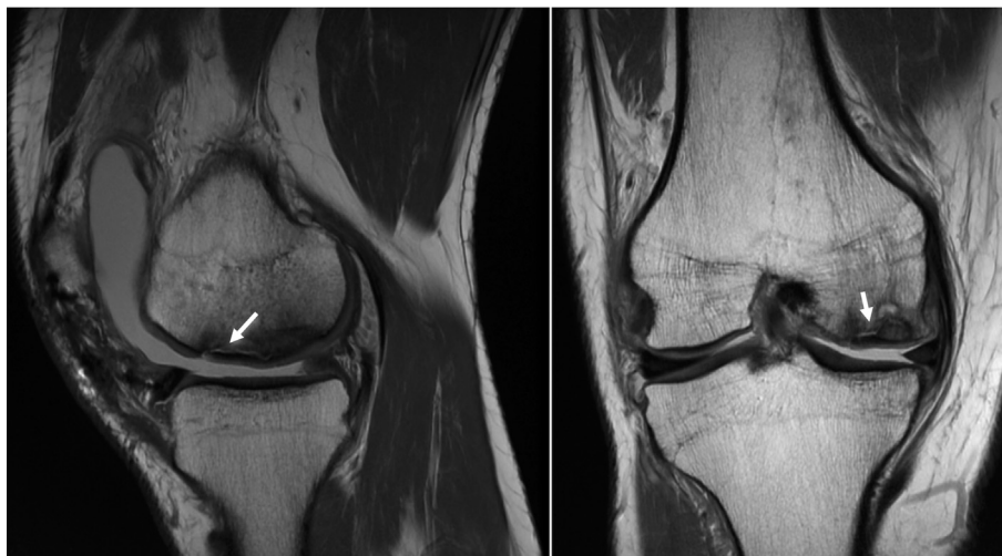
Fig. 1. Example sagittal and coronal proton density MRI showing fluid imbibition beneath the subchondral lamina of an osteochondral allograft.

The presence of fluid imbibition was associated with the need for subsequent chondroplasty ( p = 0.05 ). No other demographic or surgical factor was significant, including age, sex, race, affected side,