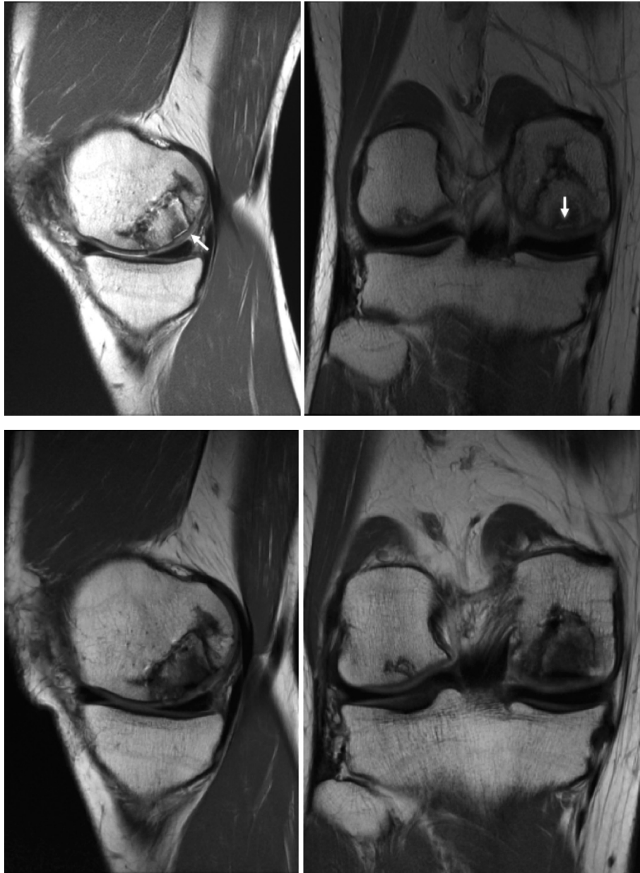
Fig. 2. A Sagittal and coronal proton density MRI scans of a patient 10 months after osteochondral allografting showing fluid imbibition at the bone-cartilage interface of the graft (white arrows). B Repeat MRI 22 months after surgery showing complete resolution of fluid imbibition.

integrity of osteochondral grafts post-operatively, either through routine surveillance studies performed at specified intervals after surgery, or in response to clinical complaints in the post-operative period. The MRI appearance of osteochondral grafts has been relatively well-described, with autograft tissue showing bony edema up to one year after surgery in half of patients and progressive fill of fissures at the graft-host interface, and a longer period of bony edema with development of an advancing front as graft bone is incorporated. 12 Additionally, complications such as bony collapse, host-immune reaction, and avascular necrosis of implanted grafts are readily identifiable on MRI, and provide diagnostic value to the surgeon during clinical decision-making. Several MRI-based scoring systems are commonly used in the cartilage repair literature to report the health of the graft based on the appearance of the subchondral bone, subchondral lamina, incorporation of transplanted tissue, and surrounding structures