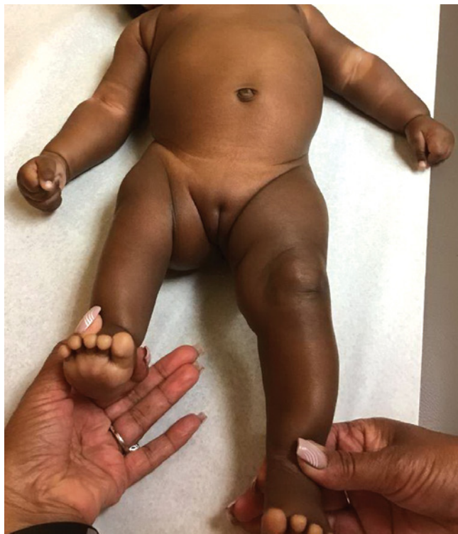
Fig. 3. Proximal femoral focal deficiency. Photograph of the infant at 3 months of age. Short right lower extremity

As stressed in the literature, prenatal diagnosis of PFFD is important, because early recognition of this malformation could provide useful information to parents and physicians regarding management and therapeutic planning (4,5) . Prenatal ultrasound is widely used to