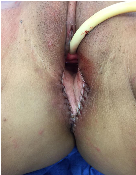
Fig. 1. Inset of VRAM flap after APR defect.

at the most superior or deep point in the pelvis (Fig. 1). The abdominal donor site was closed after colostomy placement (see summary in Fig. 2).