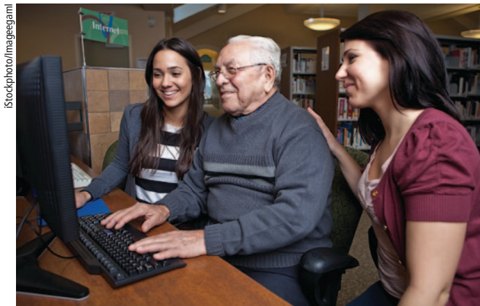
The acquisition of new health information is a function of basic cognitive skills such as working memory and language comprehension, as well as motivational factors.

However, some aspects of language comprehension are compromised in later life due to age-related declines in working memory and related abilities (Norman et al. 1992; van der Linden et al. 1999). Language that is grammatically complex or packed with concepts is particularly difficult for older adults to comprehend (Wingfield and Stine-Morrow 2000). Indeed, some research shows that older adults have more difficulty understanding health information than younger adults (Brown and Park 2002).