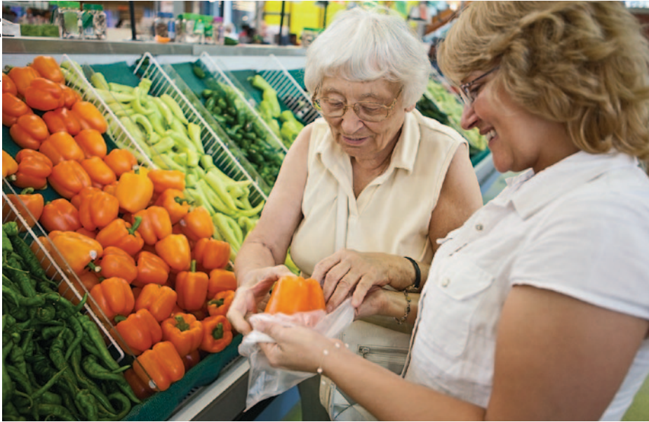
Research is needed to identify the motivational factors that promote engagement among seniors in education related to healthy behaviors, such as eating nutritious foods.

were not magnified as in the first study; in fact, the correlation was slightly attenuated after controlling for motivation ( r = -0.27, P < 0.01 ). These data fail to support the notion that health engagement strategies mitigate age-related declines in nutrition comprehension.