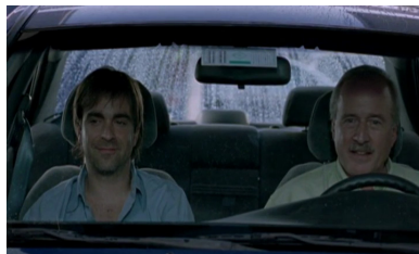
Father and son at the car wash

Gastón's successful reconciliation of family capitalism and his art contrasts with the tragic trajectory of Chernovsky. Like Gastón and his