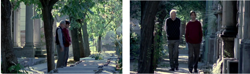
Father and son visit the cemetery

of his orphaned state and into adulthood, like the path they walk on, is straightforward: enter the family business. A position at Fernández Propiedades is not only Gastón's birthright; it is also a means of becoming an adult member of the family. This choice between growing up or remaining in a state of arrested development comes to a head when Gastón visits his father at the office to ask for a loan.