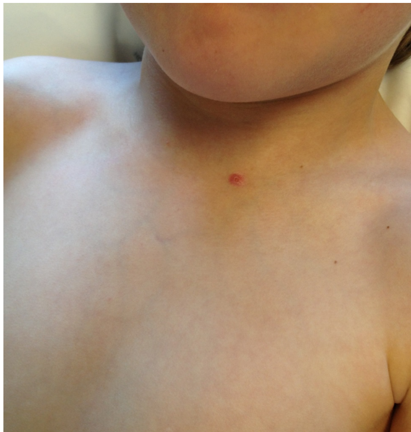
Figure 1. Clinical appearance of the lesion, located in the patient's left lower neck.

Keywords: heterotopic salivary gland tissue, ectopic salivary gland, neck.