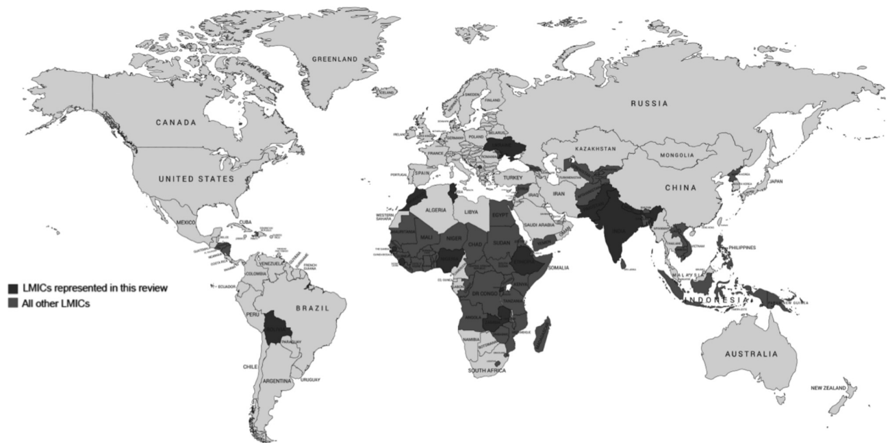
Figure 2. World map representing all LMICs that are (represented in dark gray) and are not (represented in light gray) included in this review.

Osteoporotic fracture incidence has also been heavily studied in HICs, and an increasing number of resources have been dedicated as a result, including programs aimed at both prevention and treatment of fragility fractures. [41–43] Many of the studies identified in this review were similarly aimed at the increasing incidence of fracture among aging populations, which is increasingly affecting both HICs and LMICs. There did appear to be a lower incidence of hip fracture in Sub-Saharan African countries such as Nigeria and Cameroon compared to countries in other regions including India, Ukraine, and Morocco. Data