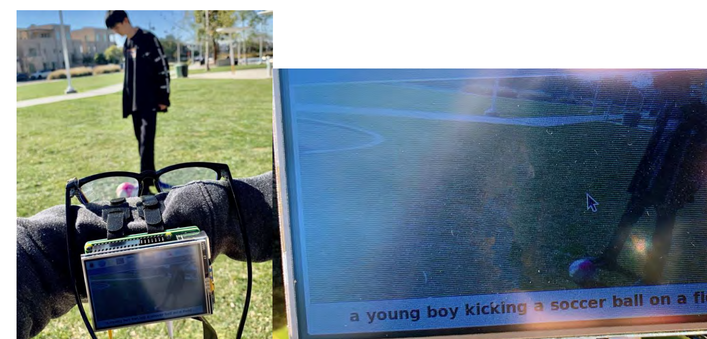
Fig. 4. Eye of Aurora generated “a young boy kicking a soccer ball on a field” to describe what it “saw”