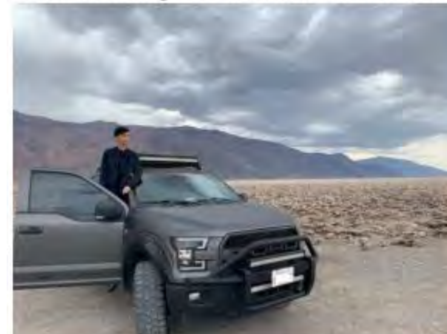
Fig. 3. An image caption example